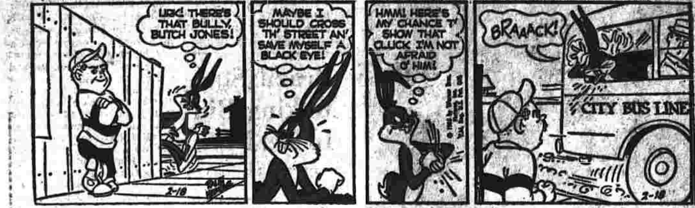
CITY BUS LINE