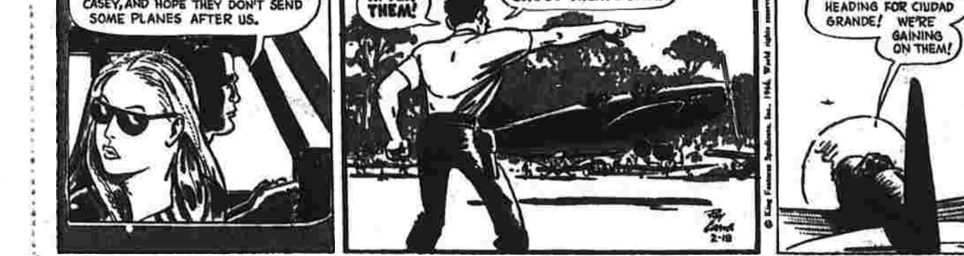
BY ROY CRANE